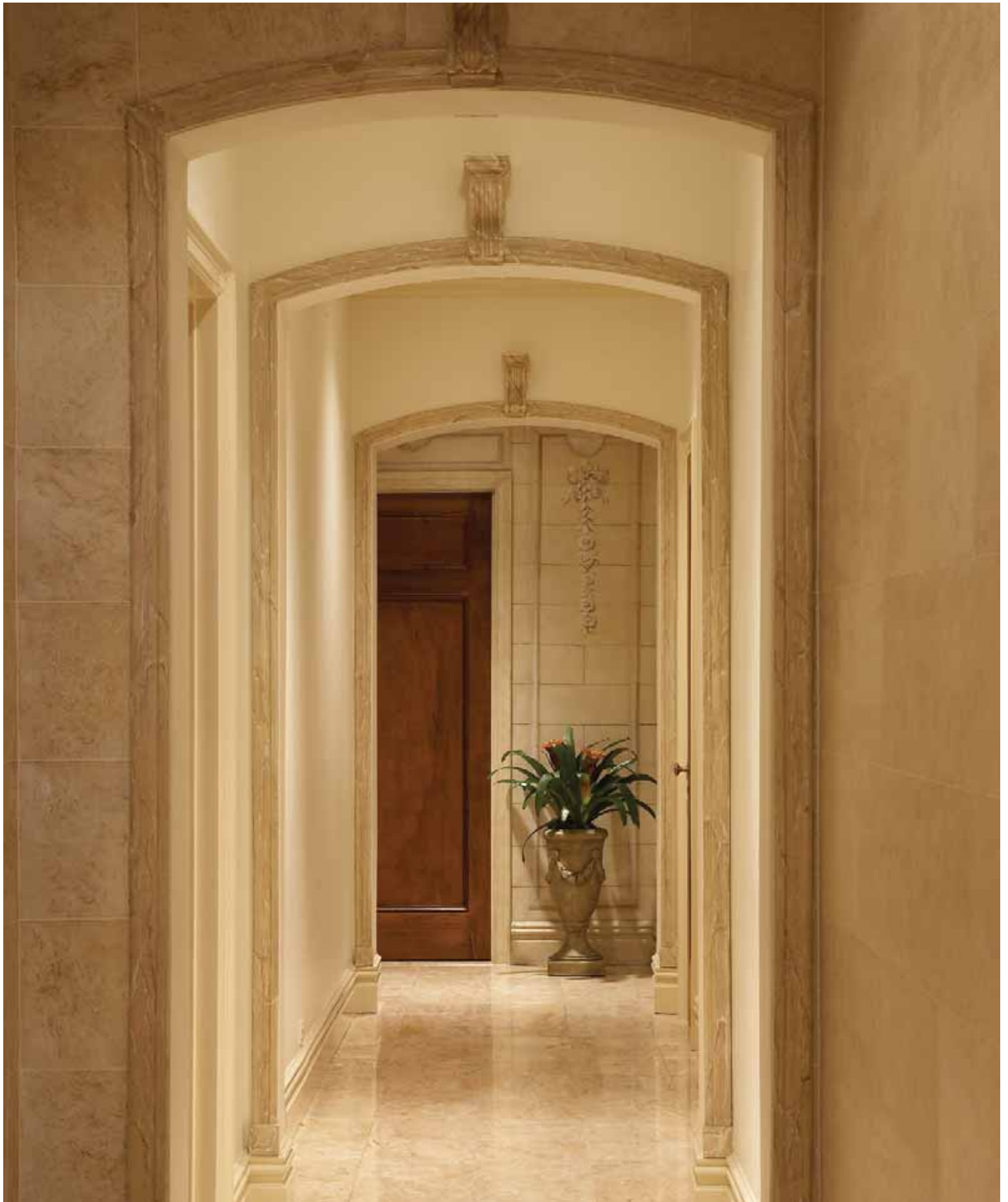
The 50-foot hallway on the upper level is daughters Chloe and Camryn's racetrack for their plasma cars—aerodynamic mini cars that speed up and down the corridor. Levy designed the custom limestone moldings and corbels on all the archways—three in the upper hallway and two in the foyer—to accentuate the architectural design.